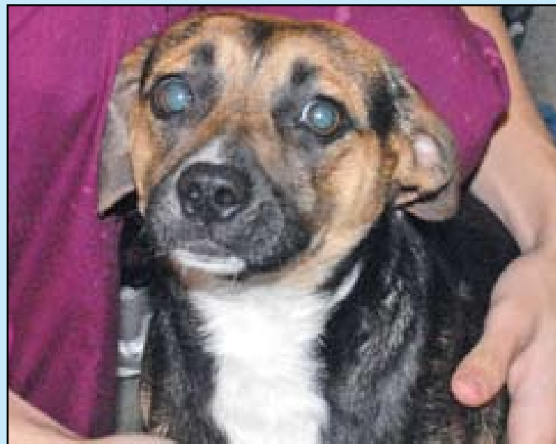
Francis the dog & Ashley the kitten

are some of the many homeless pets at the Fort Stewart animal shelter. The shelter has pets of all kinds, sizes and breeds in their care. If you are interested in adopting, call the Fort Stewart Veterinary Clinic at 767-2842.