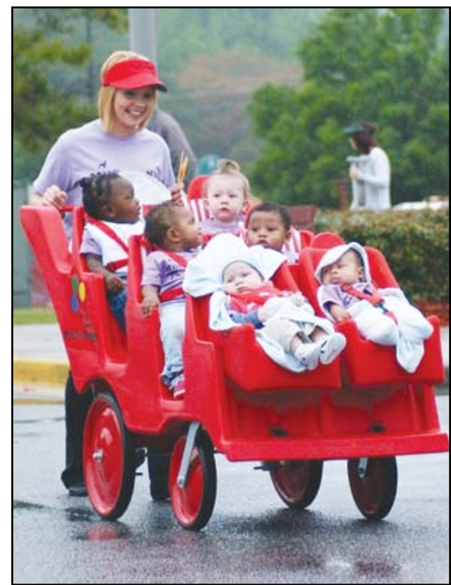
Army Families celebrated Month of the Military Child with a kick-off parade at Hunter Army Airfield's Child Development Center, April 1.

The rain held off as children - ages six weeks to six years - parents, volunteers and staff