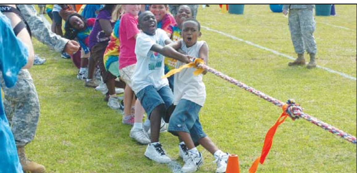
Students from Taylors Creek Elementary participate in a game of tug-of-war at the annual Field Day celebrations.

Taylors Creek Elementary will continue its Field Day celebrations all this week. Call (912) 369-0378 for more information.