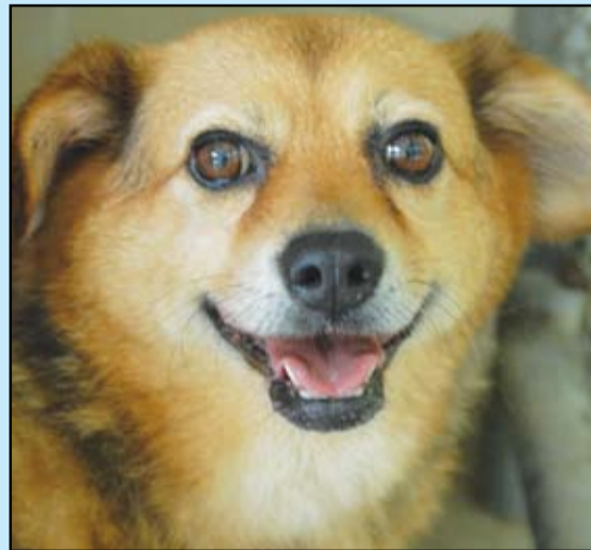
Texas the dog & Blue the cat

are two of the many homeless pets at the Fort Stewart animal shelter. The shelter has pets of all kinds, sizes and breeds in their care. If you are interested in adopting, call the Fort Stewart Veterinary Clinic at 767-2842. NOTE: The shelter will be closed for lunch next week, 11:30 a.m. to 1 p.m.