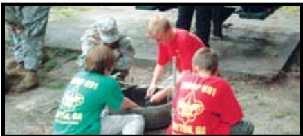
Boy Scouts survive the great outdoors See Page 3B

Midway Cemetery offers historic tours More info on Page 5B