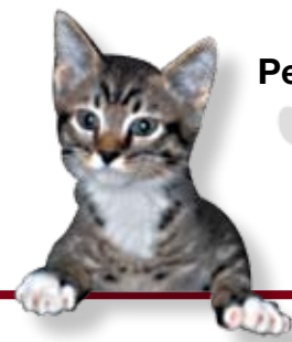
Pets in need of a good home See Page 3B