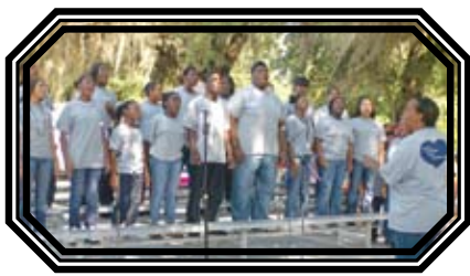
Project GANG at Riceboro See Page 5B