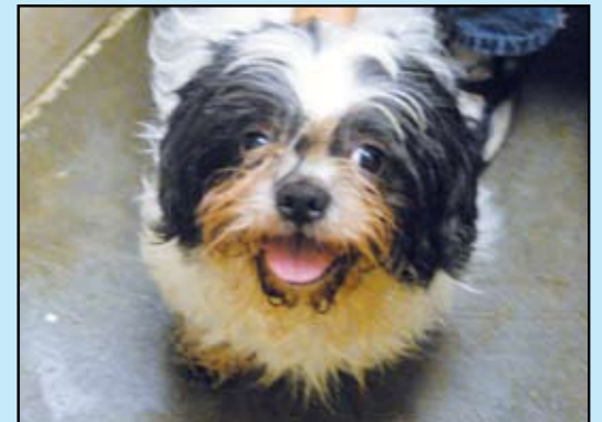
Eddie the dog & Hank the cat

are two of the many homeless pets at the Fort Stewart animal shelter. The shelter has pets of all kinds, sizes and breeds in their care. If you are interested in adopting, call the Fort Stewart Veterinary Clinic at 767-2842.