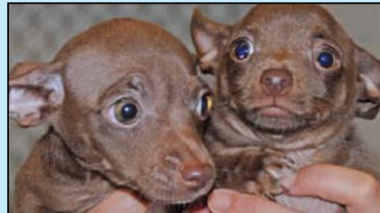
Fritz and Gudrun the puppies & Runaway the cat

are two of the many homeless pets at the Fort Stewart animal shelter. The shelter has pets of all kinds, sizes and breeds in their care. If you are interested in adopting, call the Fort Stewart Veterinary Clinic at 767-2842.