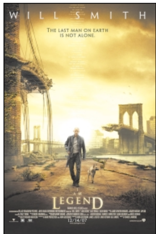
Films are subject to availability. AAFES strives to show films according to the published schedule, but reserves the right to reschedule, cancel, or substitute showings as needed. For more information, call 767-3069.

Saturday— 7 p.m. (Will Smith, Alice Braga) Robert Neville is a brilliant scientist, but even he could not contain the terrible virus that was unstoppable, incurable...and manmade. Somehow immune, Neville is now the last human survivor in what is left of New York City...and maybe the world. But he is not alone. He is surrounded by "the Infected"--victims of the plague who have mutated into carnivorous beings who can only exist in the dark and who will devour or infect anyone or anything in their path. Rated PG-13 (intense sequences of sci-fi action & violence) 122 min