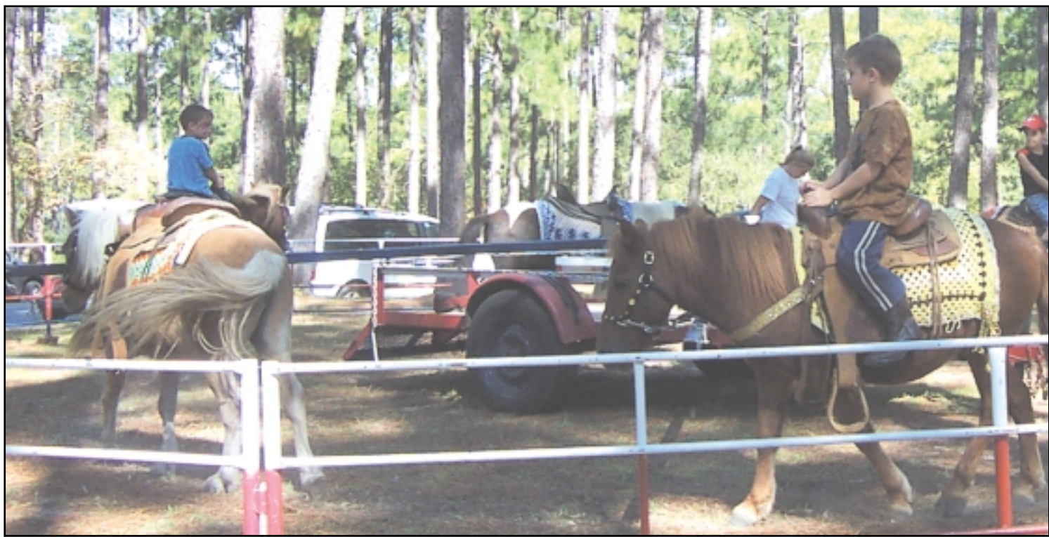
Children enjoy pony rides at the 2006 Wiregrass Festival. The feature returns for the Sept. 29 event at Gordonia-Alatamaha State park in Reidsville.