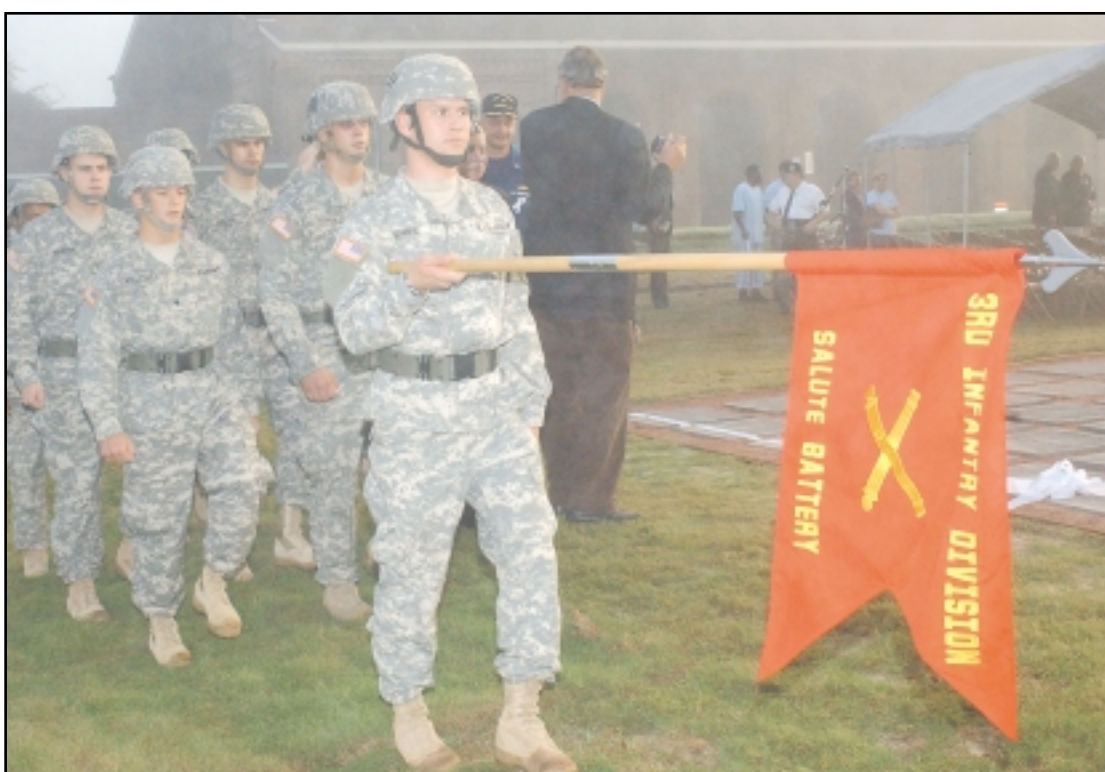
The 3rd Inf. Div.'s Salute Battery marches to their position to give a 21-Gun Salute at the ceremony.