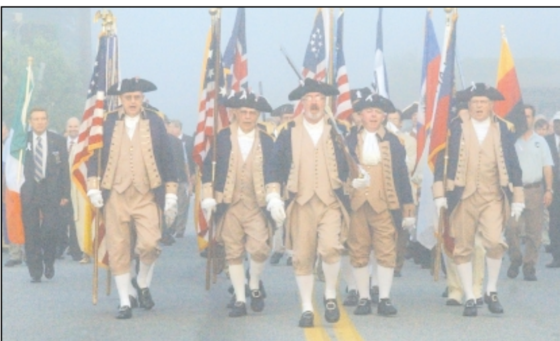
Re-enactors of the Revolutionary War march up Louisville Road in Savannah, retracing the route of the Revolutionary forces that attacked the British Oct. 9, 1779. The march ended at Battlefield Memorial Park with a dedication ceremony to honor the thousands of troops that clashed, and the hundreds who died, in a bloody Revolutionary War Battle on Oct. 9, 1779.